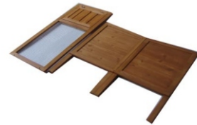
Step 3 prepare to build the main house