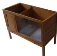
Step 7 Put the waterproof roof on and don't screw