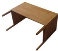
Step 4 Assemble the back wall to the side frame