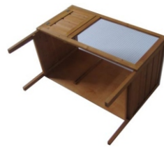
Step 5 Upturn and assemble the front board with door