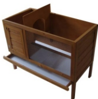
Step 6 Upturn and insert the waterproof drawer and small hole board