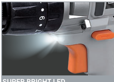
SUPER BRIGHT LED