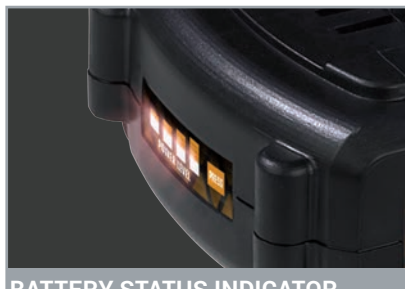
BATTERY STATUS INDICATOR