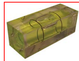
Fig. 3 Frame Leveller