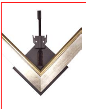
Fig.1 Frame Clamp

When you hang the picture frame on the wall, place the Frame Leveller on top of the frame and adjust the frame so that the bubble is in the middle of the Frame Leveller lines. (See Fig.3)